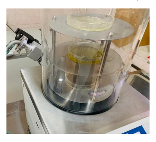
Figure 1 - ALPHA 1-2 LDplus laboratory setup

Studies to determine the technological modes of freeze-drying of honey were carried out on a laboratory unit ALPHA 1-2 LDplus (Figure 1).