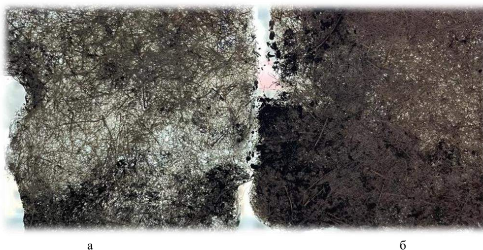
a) sample of untreated material; b) sample of the material treated with brass nanoparticles

(GOST 9.060–75) [3]. According to GOST 9.060–75 the material is considered resistant to bio damage at I \geq 80\% .