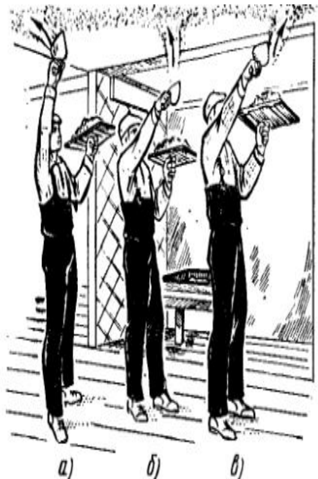
Picture 1. Sketch of solution a plaster shovel on a ceiling. a) through the head; b) over; c) from [3]

Today we can finish differently walls from concrete or a brick: to revet them with panels, a tile, plaster cardboard. However many prefer an old classical way – plastering in which walls become covered by a plaster coat – the solution consisting of cement and sand. And the plasterer performs this work. The plasterer works in the construction and repair organizations. To be exact takes active part in construction and repair - he completely is responsible for the surfaces of the room. Finishes walls and a ceiling, paints, pastes over with wall-paper, makes decorative processing. In operating time the plasterer eliminates bricklaying defects, separate mistakes made at installation of prefabricated elements, improving appearance and quality of designs (picture 1).