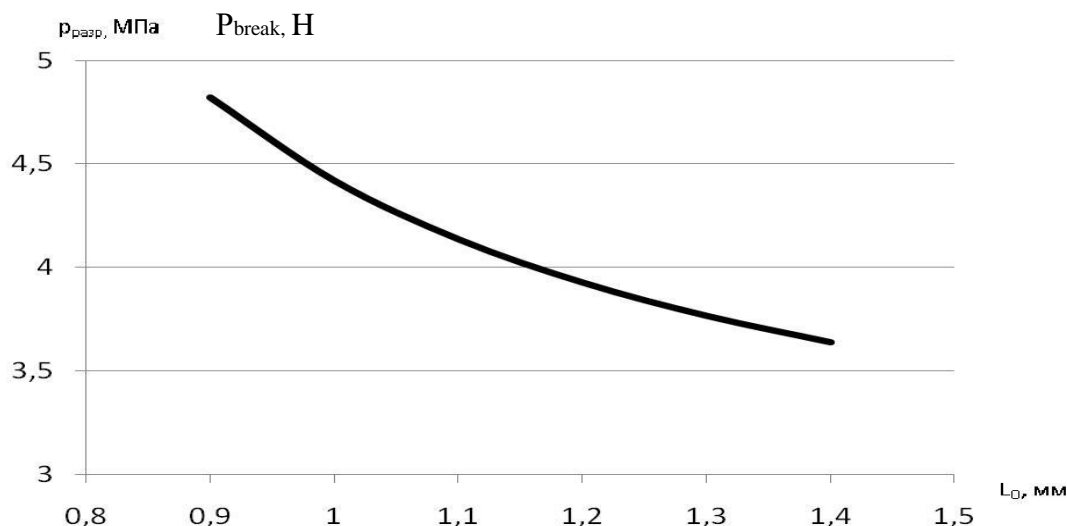
Figure 1 – The dependence of the disruptive pressure value p_{разр} on the geometric density on the warp L_o of the woven reinforcing frame of the latex PFH with a diameter of 77 mm

warp and the weft threads of the woven reinforcing frame of the latex PFH manufactured by BEREG PA (production association) with a diameter of 77 mm, designed for the operating pressure of 1.6 H, are shown in accordance with Figures 1 and 2.