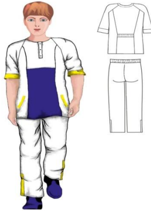
Figure 1 – Model A