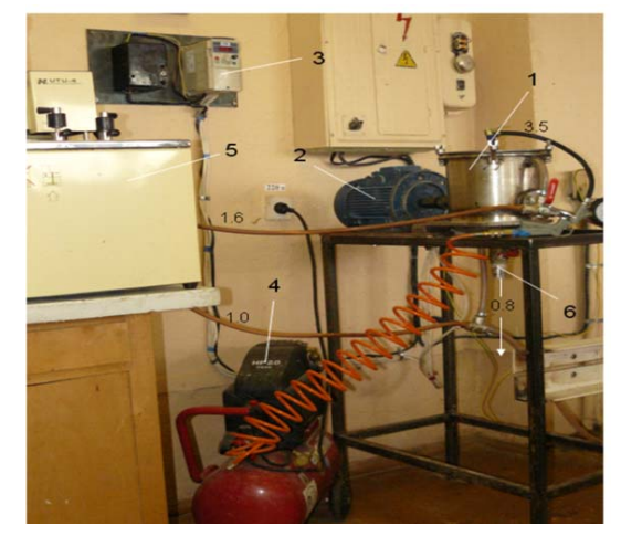
Fig. 1. Scheme of experimental laboratory installation

Table 2 . Performance components of bakery products