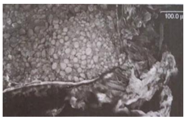
Fig 2. SEM micrograph showing papery and shriveled pericarp of triticale grain