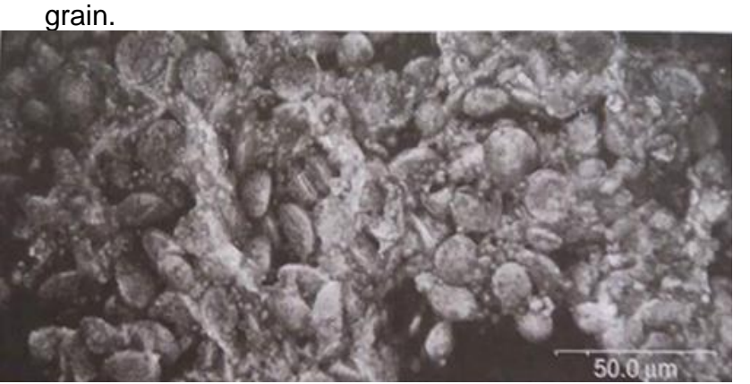
Fig 3. SEM micrograph of triticale starch

Starch high in amylose is preferred for human and ruminant consumption due to slower digestion and absorption. In triticale, the apparent amylose content was judged to be highly variable, ranging from 12.8 to 35.1 g /100 g of total starch (based on maize standards), in particular when compared to that of wheat which ranges 26.9 to 42.8 g/100 g [10].